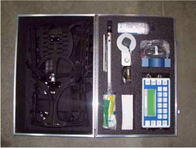
■ Envi Pro system package